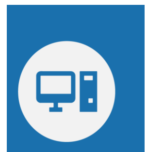
Connect PC to get PDF Report & CSV file