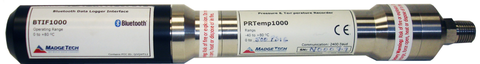
The BTIF1000 easily connects to a logger to give the device wireless capabilities.

The BTIF1000 is equipped with one button operation making downloading and restarting easy. It is rated IP67, and can be used in wet or underwater environments.